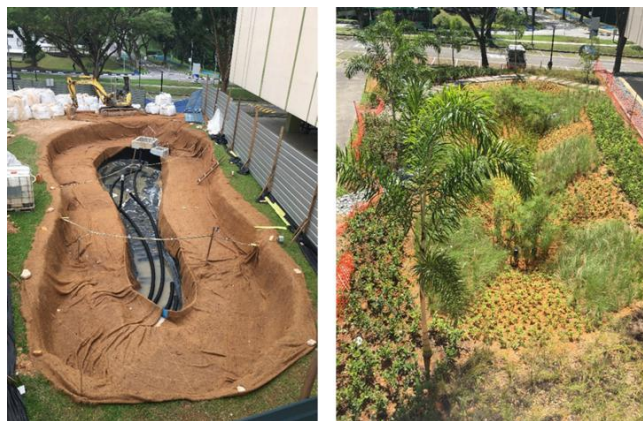
Figure 3. Construction and evolution over time of a green garden in Singapore (Petschek et al., 2024)

Experiences around the world show that the combination of predictive technology with nature-based solutions increases urban resilience. In Singapore, the use of CNNs alongside rain gardens and urban reservoirs demonstrates the synergy between flood forecasting and environmental mitigation (Li & Stouffs, 2024). In Barcelona, real-time information reinforces the effectiveness of preventive measures. In Curitiba, the adoption of LSTM, combined with potential retention areas, could further enhance the effectiveness of preventive actions.